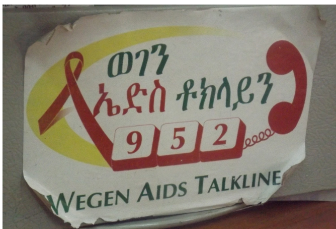
The Wegen AIDS Talkline sign

Global examples of such transitions are few. The experience in Ethiopia demonstrates strengthened SBCC capacity within a country's SBCC capacity ecosystem.