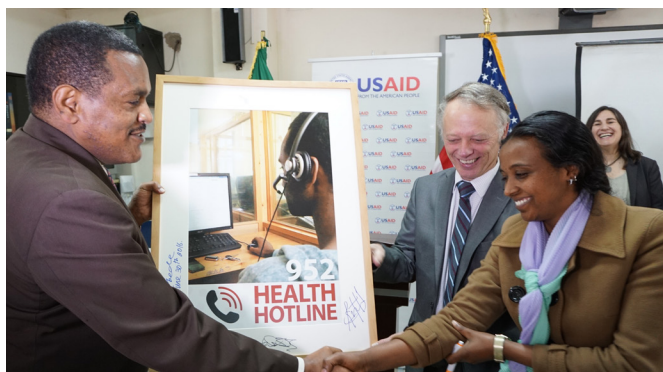
The official transition event of the NARC services to the FMOH, June 30, 2016.